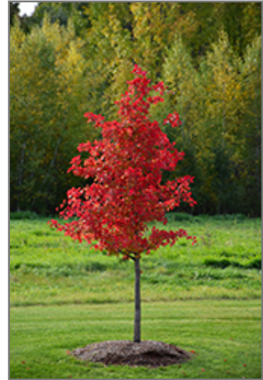
Wildfire Black Gum in fall