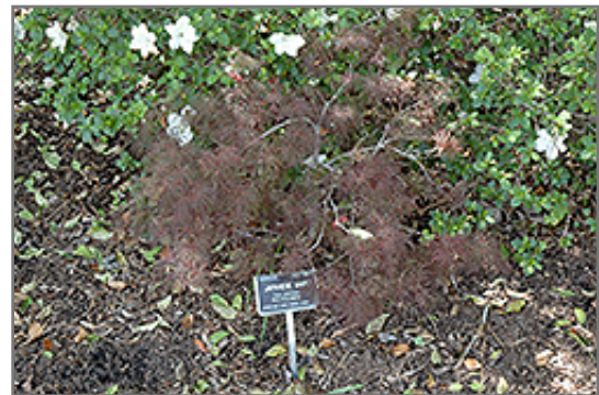
Red Feathers Japanese Maple