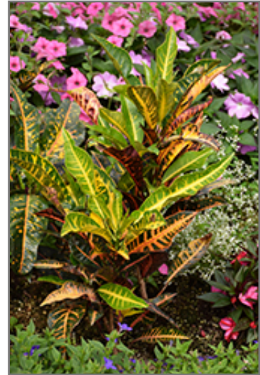
Variegated Croton