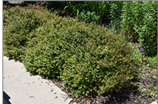
Rose Creek Abelia

Rose Creek Abelia will grow to be about 4 feet tall at maturity, with a spread of 5 feet. It tends to fill out right to the ground and therefore doesn't necessarily require facer plants in front. It grows at a slow rate, and under ideal conditions can be expected to live for approximately 30 years.