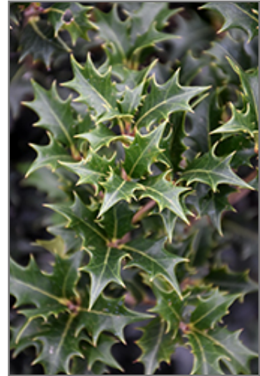
Gulftide False Holly foliage