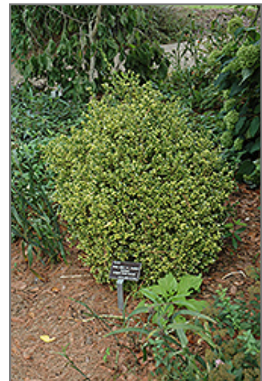
Sunburst Variegated Korean Boxwood