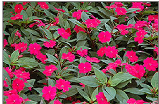
Bounce Cherry Impatiens in bloom