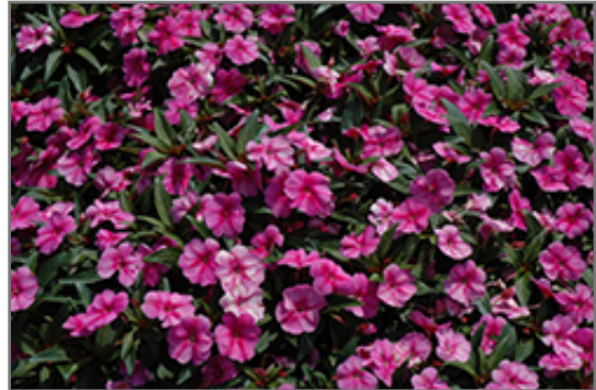
Bounce Pink Flame Impatiens flowers

Bounce Pink Flame Impatiens is recommended for the following landscape applications;