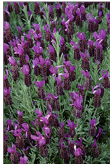
Anouk Supreme Spanish Lavender flowers

Anouk Supreme Spanish Lavender is recommended for the following landscape applications;