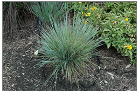
Standing Ovation Bluestem