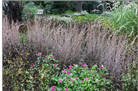
Standing Ovation Bluestem in fall

Standing Ovation Bluestem is recommended for the following landscape applications;