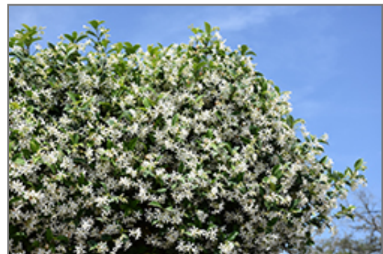
Madison Star-Jasmine flowers