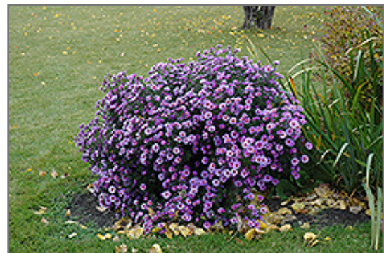
Purple Dome Aster in bloom