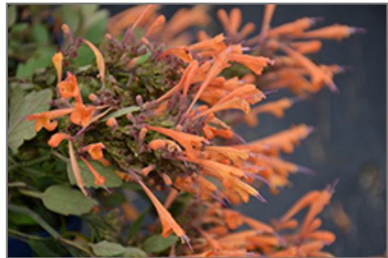
Kudos Mandarin Hyssop flowers