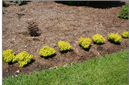
Sunjoy Mini Saffron Japanese Barberry (pruned as hedge)

This shrub does best in full sun to partial shade. It is very adaptable to both dry and moist growing conditions, but will not tolerate any standing water. It is not particular as to soil type or pH, and is able to handle environmental salt. It is highly tolerant of urban pollution and will even thrive in inner city environments. This is a selected variety of a species not originally from North America.