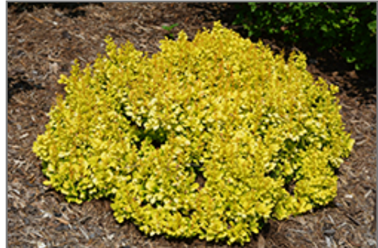
Sunjoy Mini Saffron Japanese Barberry

Sunjoy Mini Saffron Japanese Barberry is recommended for the following landscape applications;