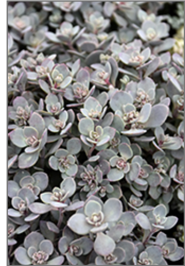
SunSparkler Blue Elf Sedoro foliage

SunSparkler Blue Elf Sedoro is a fine choice for the garden, but it is also a good selection for planting in outdoor pots and containers. Because of its spreading habit of growth, it is ideally suited for use as a 'spiller' in the 'spiller-thriller-filler' container combination; plant it near the edges where it can spill gracefully over the pot. Note that when growing plants in outdoor containers and baskets, they may require more frequent waterings than they would in the yard or garden.