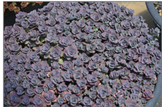
SunSparkler Blue Elf Sedoro