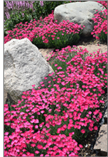
Paint The Town Magenta Pinks in bloom

Paint The Town Magenta Pinks is an herbaceous evergreen perennial with a mounded form. It brings an extremely fine and delicate texture to the garden composition and should be used to full effect.