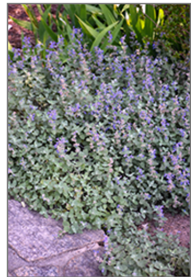
Early Bird Catmint in bloom