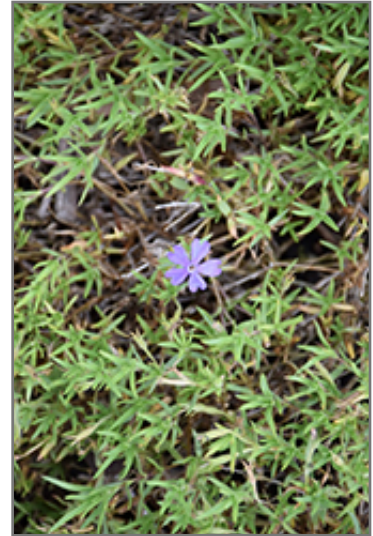
Violet Pinwheels Phlox flowers

Violet Pinwheels Phlox is recommended for the following landscape applications;