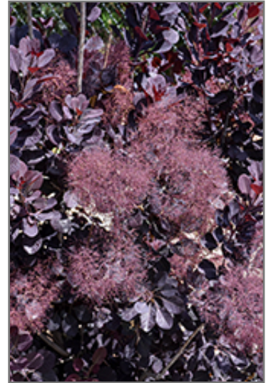
Velveteeny Purple Smokebush flowers

Velveteeny Purple Smokebush is recommended for the following landscape applications;