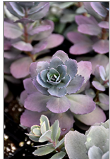
Plum Dazzled Stonecrop foliage