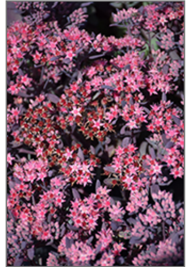
Plum Dazzled Stonecrop flowers

Plum Dazzled Stonecrop is a dense herbaceous perennial with an upright spreading habit of growth. Its medium texture blends into the garden, but can always be balanced by a couple of finer or coarser plants for an effective composition.