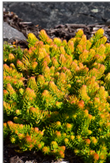
Angelina Stonecrop foliage

Angelina Stonecrop is recommended for the following landscape applications;