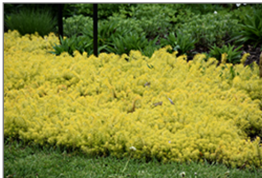
Angelina Stonecrop

This plant does best in full sun to partial shade. It prefers dry to average moisture levels with very well-drained soil, and will often die in standing water. It is considered to be drought-tolerant, and thus makes an ideal choice for a low-water garden or xeriscape application. It is not particular as to soil pH, but grows best in poor soils, and is able to handle environmental salt. It is highly tolerant of urban pollution and will even thrive in inner city environments. This is a selected variety of a species not originally from North America. It can be propagated by division; however, as a cultivated variety, be aware that it may be subject to certain restrictions or prohibitions on propagation.