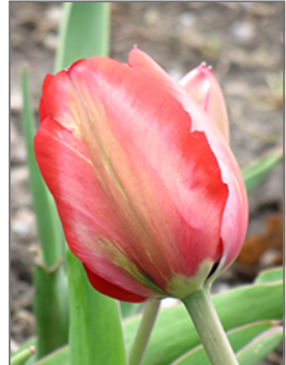
Menton Tulip flowers