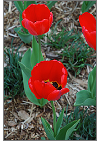
Parade Tulip flowers