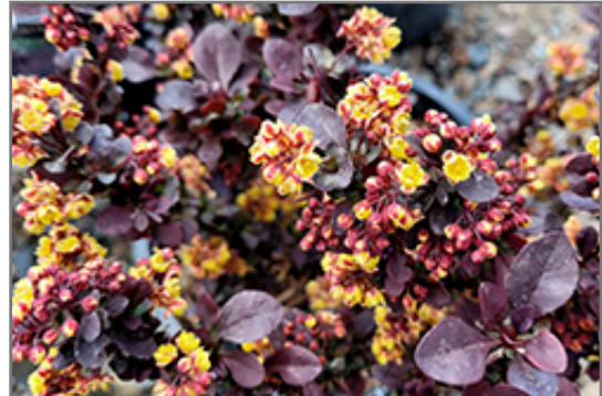
Concorde Japanese Barberry flowers

Concorde Japanese Barberry makes a fine choice for the outdoor landscape, but it is also well-suited for use in outdoor pots and containers. It is often used as a 'filler' in the 'spiller-thriller-filler' container combination, providing a mass of flowers and foliage against which the thriller plants stand out. Note that when grown in a container, it may not perform exactly as indicated on the tag - this is to be expected. Also note that when growing plants in outdoor containers and baskets, they may require more frequent waterings than they would in the yard or garden.