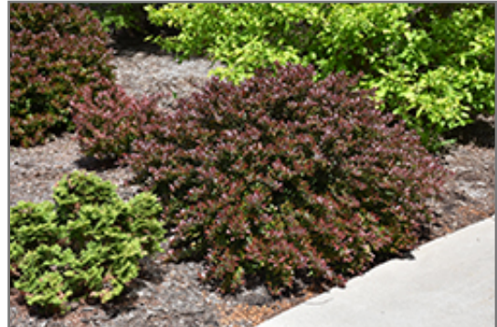
Concorde Japanese Barberry