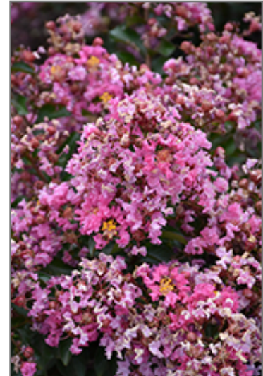
Barista Peppermint Mocha Crapemyrtle flowers

This is a relatively low maintenance shrub, and is best pruned in late winter once the threat of extreme cold has passed. It is a good choice for attracting bees to your yard, but is not particularly attractive to deer who tend to leave it alone in favor of tastier treats. It has no significant negative characteristics.