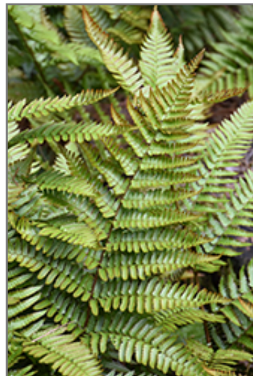
Autumn Fern foliage

Autumn Fern is recommended for the following landscape applications;