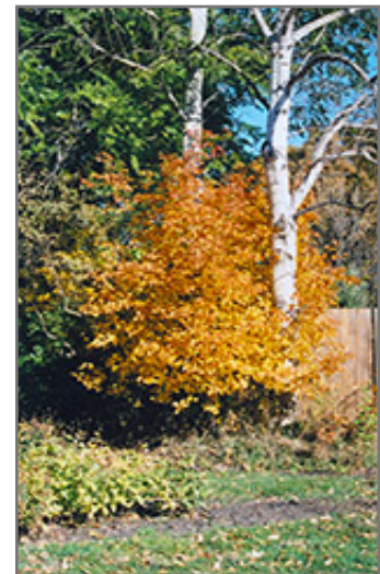
Saskatoon in fall