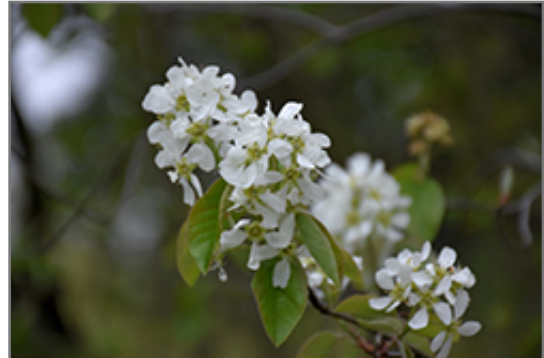
Saskatoon flowers

Saskatoon is a multi-stemmed deciduous shrub with an upright spreading habit of growth. Its relatively fine texture sets it apart from other landscape plants with less refined foliage.