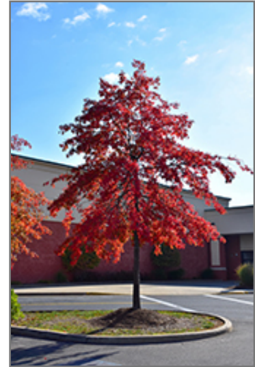
Pin Oak in fall

Pin Oak is recommended for the following landscape applications;