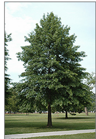
Pin Oak