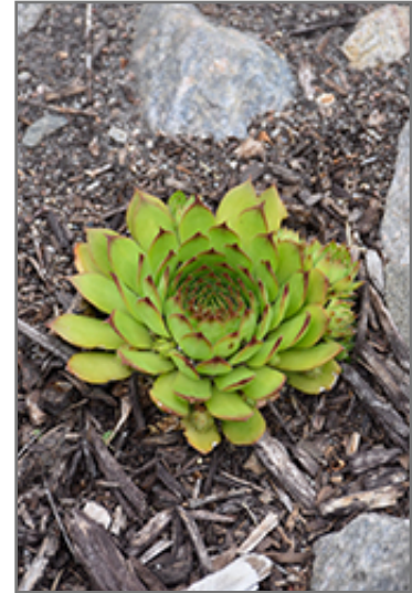
Sunset Hens And Chicks

Sunset Hens And Chicks is recommended for the following landscape applications;