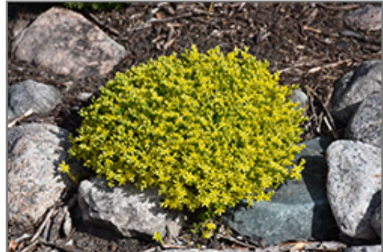
Golden Moss Stonecrop in bloom

Golden Moss Stonecrop is recommended for the following landscape applications;