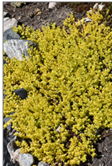
Goldilocks Creeping Jenny

Goldilocks Creeping Jenny is a fine choice for the garden, but it is also a good selection for planting in outdoor containers and hanging baskets. Because of its spreading habit of growth, it is ideally suited for use as a 'spiller' in the 'spiller-thriller-filler' container combination; plant it near the edges where it can spill gracefully over the pot. Note that when growing plants in outdoor containers and baskets, they may require more frequent waterings than they would in the yard or garden.