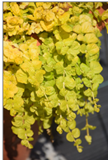
Goldilocks Creeping Jenny foliage