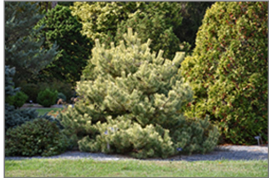
Gold Coin Scotch Pine

This tree should only be grown in full sunlight. It prefers dry to average moisture levels with very well-drained soil, and will often die in standing water. It is considered to be drought-tolerant, and thus makes an ideal choice for xeriscaping or the moisture-conserving landscape. It is not particular as to soil type or pH. It is highly tolerant of urban pollution and will even thrive in inner city environments. This is a selected variety of a species not originally from North America.