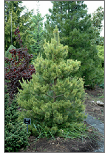
Gold Coin Scotch Pine

Gold Coin Scotch Pine is a multi-stemmed evergreen tree with a more or less rounded form. Its average texture blends into the landscape, but can be balanced by one or two finer or coarser trees or shrubs for an effective composition.