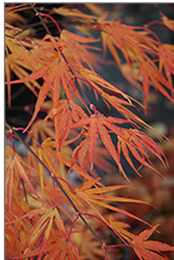
Scolopendrifolium Japanese Maple in fall

Scolopendrifolium Japanese Maple is a fine choice for the yard, but it is also a good selection for planting in outdoor pots and containers. Its large size and upright habit of growth lend it for use as a solitary accent, or in a composition surrounded by smaller plants around the base and those that spill over the edges. It is even sizeable enough that it can be grown alone in a suitable container. Note that when grown in a container, it may not perform exactly as indicated on the tag - this is to be expected. Also note that when growing plants in outdoor containers and baskets, they may require more frequent waterings than they would in the yard or garden.