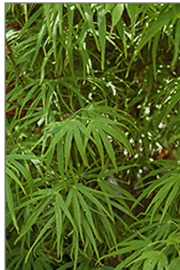
Scolopendrifolium Japanese Maple foliage

Scolopendrifolium Japanese Maple is recommended for the following landscape applications;