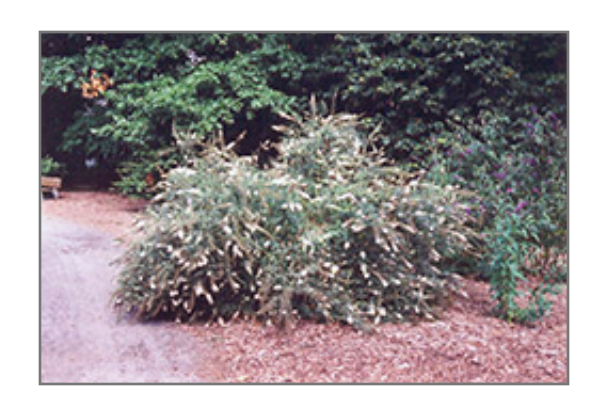
Butterfly Bush in bloom