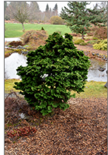
Dwarf Hinoki Falsecypress