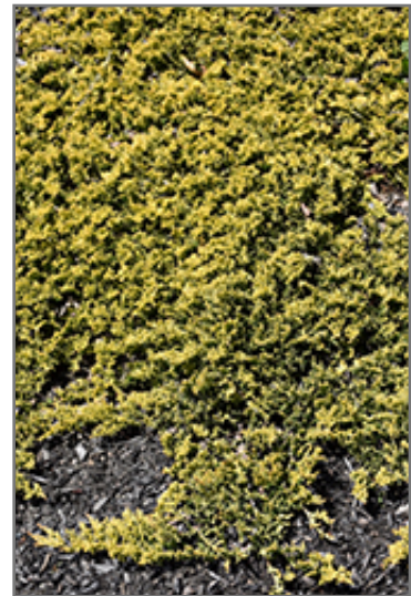
Mother Lode Juniper foliage