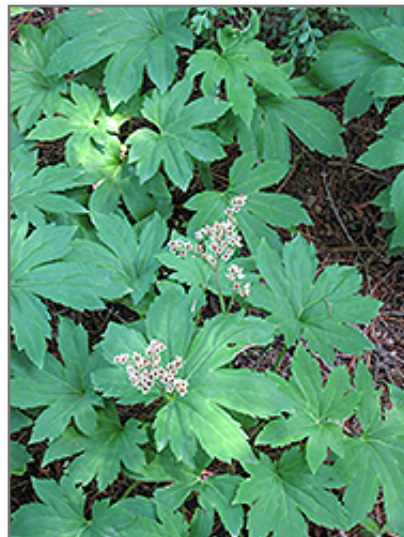
Crimson Fans Mukdenia flowers

Crimson Fans Mukdenia will grow to be about 12 inches tall at maturity extending to 18 inches tall with the flowers, with a spread of 24 inches. When grown in masses or used as a bedding plant, individual plants should be spaced approximately 20 inches apart. Its foliage tends to remain dense right to the ground, not requiring facer plants in front. It grows at a medium rate, and under ideal conditions can be expected to live for approximately 10 years. As an herbaceous perennial, this plant will usually die back to the crown each winter, and will regrow from the base each spring. Be careful not to disturb the crown in late winter when it may not be readily seen!