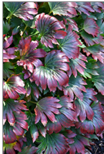
Crimson Fans Mukdenia foliage

This is a relatively low maintenance plant, and is best cleaned up in early spring before it resumes active growth for the season. It has no significant negative characteristics.