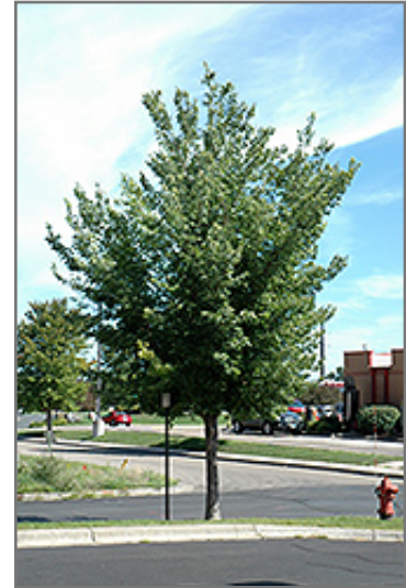
Common Hackberry