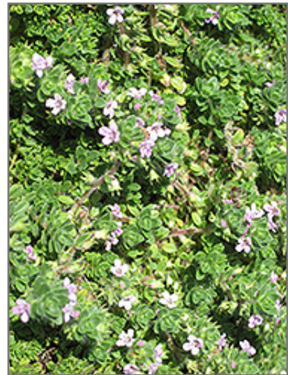
Pink Chintz Creeping Thyme flowers