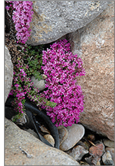
Pink Chintz Creeping Thyme in bloom

This plant should only be grown in full sunlight. It prefers to grow in average to dry locations, and dislikes excessive moisture. It is considered to be drought-tolerant, and thus makes an ideal choice for a low-water garden or xeriscape application. It is not particular as to soil type or pH. It is highly tolerant of urban pollution and will even thrive in inner city environments. Consider covering it with a thick layer of mulch in winter to protect it in exposed locations or colder microclimates. This is a selected variety of a species not originally from North America. It can be propagated by division; however, as a cultivated variety, be aware that it may be subject to certain restrictions or prohibitions on propagation.