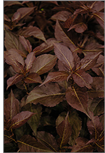
Shining Sensation Weigela foliage

This shrub should only be grown in full sunlight. It prefers to grow in average to moist conditions, and shouldn't be allowed to dry out. It is not particular as to soil type or pH. It is highly tolerant of urban pollution and will even thrive in inner city environments. This is a selected variety of a species not originally from North America.