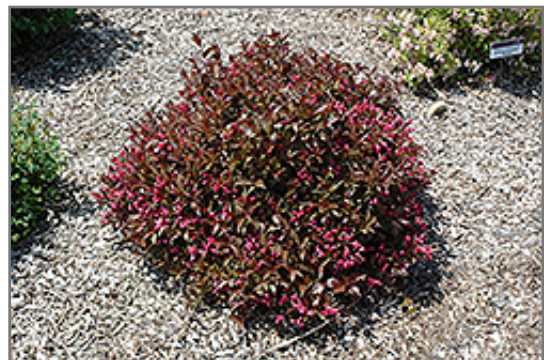
Shining Sensation Weigela in bloom