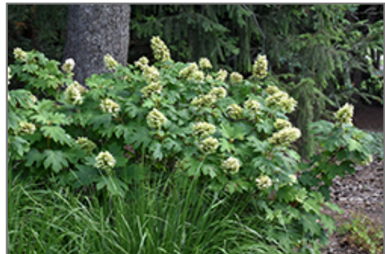
Alice Hydrangea in bloom