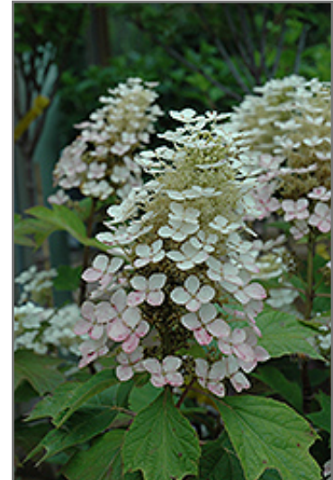
Alice Hydrangea flowers

Alice Hydrangea is recommended for the following landscape applications;