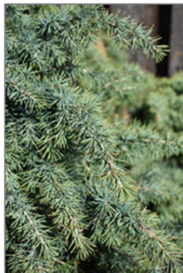
Divinely Blue Deodar Cedar foliage