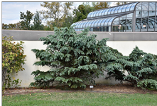
Divinely Blue Deodar Cedar

Divinely Blue Deodar Cedar is recommended for the following landscape applications;