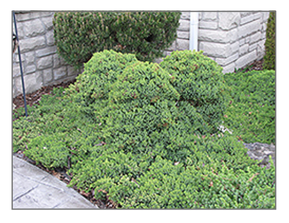
Dwarf Japanese Garden Juniper

Dwarf Japanese Garden Juniper is a dense multi-stemmed evergreen shrub with a ground-hugging habit of growth. It lends an extremely fine and delicate texture to the landscape composition which should be used to full effect.