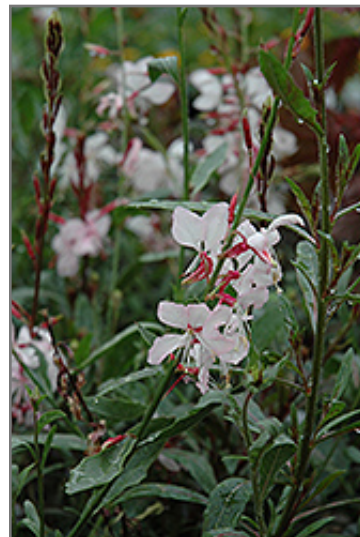
Ballerina Blush Gaura flowers

This is a relatively low maintenance plant, and is best cleaned up in early spring before it resumes active growth for the season. It is a good choice for attracting butterflies to your yard, but is not particularly attractive to deer who tend to leave it alone in favor of tastier treats. It has no significant negative characteristics.