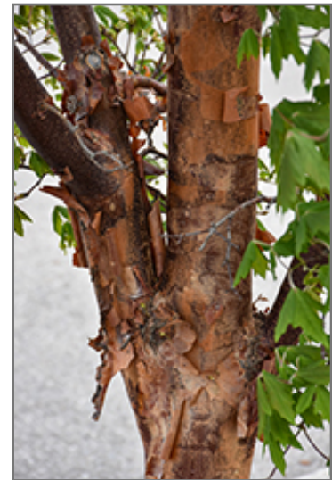
Paperbark Maple bark