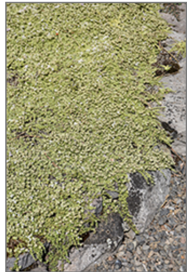
Highland Cream Creeping Thyme