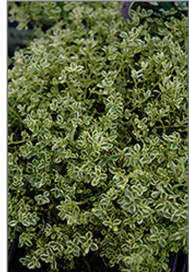
Highland Cream Creeping Thyme