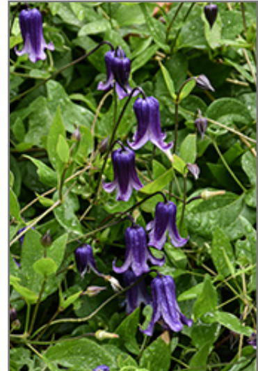
Rooguchi Clematis flowers

Rooguchi Clematis is recommended for the following landscape applications;