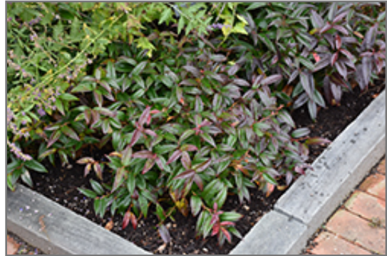
Scarletta Fetterbush

This shrub does best in partial shade to shade. It does best in average to evenly moist conditions, but will not tolerate standing water. It is not particular as to soil type, but has a definite preference for acidic soils. It is somewhat tolerant of urban pollution. This is a selection of a native North American species.