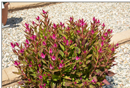
Intenz Classic Celosia in bloom

Intenz Classic Celosia will grow to be about 14 inches tall at maturity, with a spread of 12 inches. When grown in masses or used as a bedding plant, individual plants should be spaced approximately 10 inches apart. Its foliage tends to remain dense right to the ground, not requiring facer plants in front. This fast-growing annual will normally live for one full growing season, needing replacement the following year.