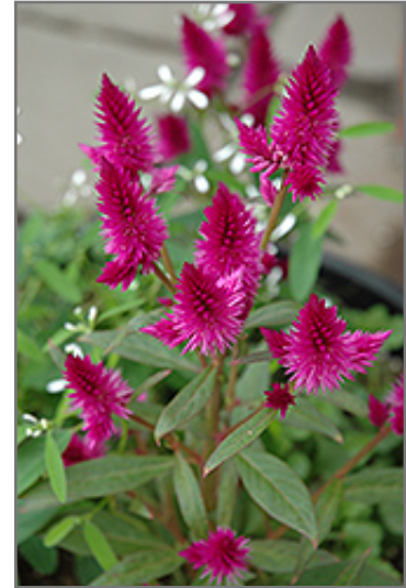
Intenz Classic Celosia flowers

Intenz Classic Celosia is recommended for the following landscape applications;