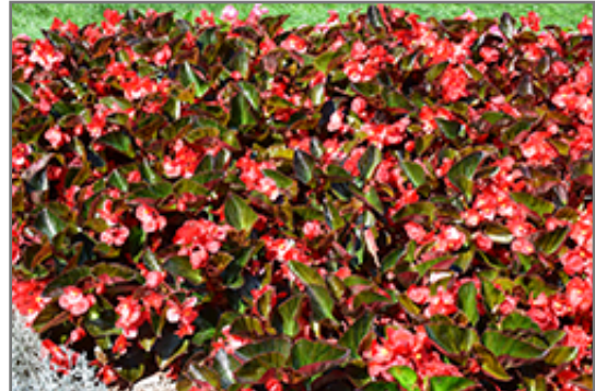
Big Red Bronze Leaf Begonia in bloom

Big Red Bronze Leaf Begonia is a fine choice for the garden, but it is also a good selection for planting in outdoor containers and hanging baskets. It is often used as a 'filler' in the 'spiller-thriller-filler' container combination, providing a mass of flowers and foliage against which the larger thriller plants stand out. Note that when growing plants in outdoor containers and baskets, they may require more frequent waterings than they would in the yard or garden.